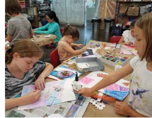
Students at the Museum's Summer Art Camps form friendships while creating compositions with line, shape, and color.