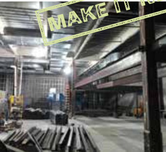
HVAC, Inc. has been working hard the past few months installing critical mechanical and climate systems, a major component of the new building.