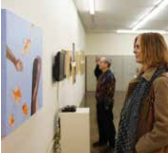
A visitor studies one of the works on view in the 2017 Western North Carolina Regional Scholastic Art Awards exhibition. The 2018 exhibition goes on view January 27.

The Asheville Art Museum is the regional host of the annual Scholastic Art juried competition for students in grades 7-12 from all across WNC. The regional program is supported by the Museum’s volunteer docents, the Asheville Area Section of the American Institute of Architects and Base Camp AVL. For this exhibition, a selection of artwork receiving regional awards will be on view.