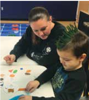
The Museum continues to host kids’ programs at public libraries throughout the community.

FEBRUARY 25 — 1:30 p.m. Diana Wortham Theatre