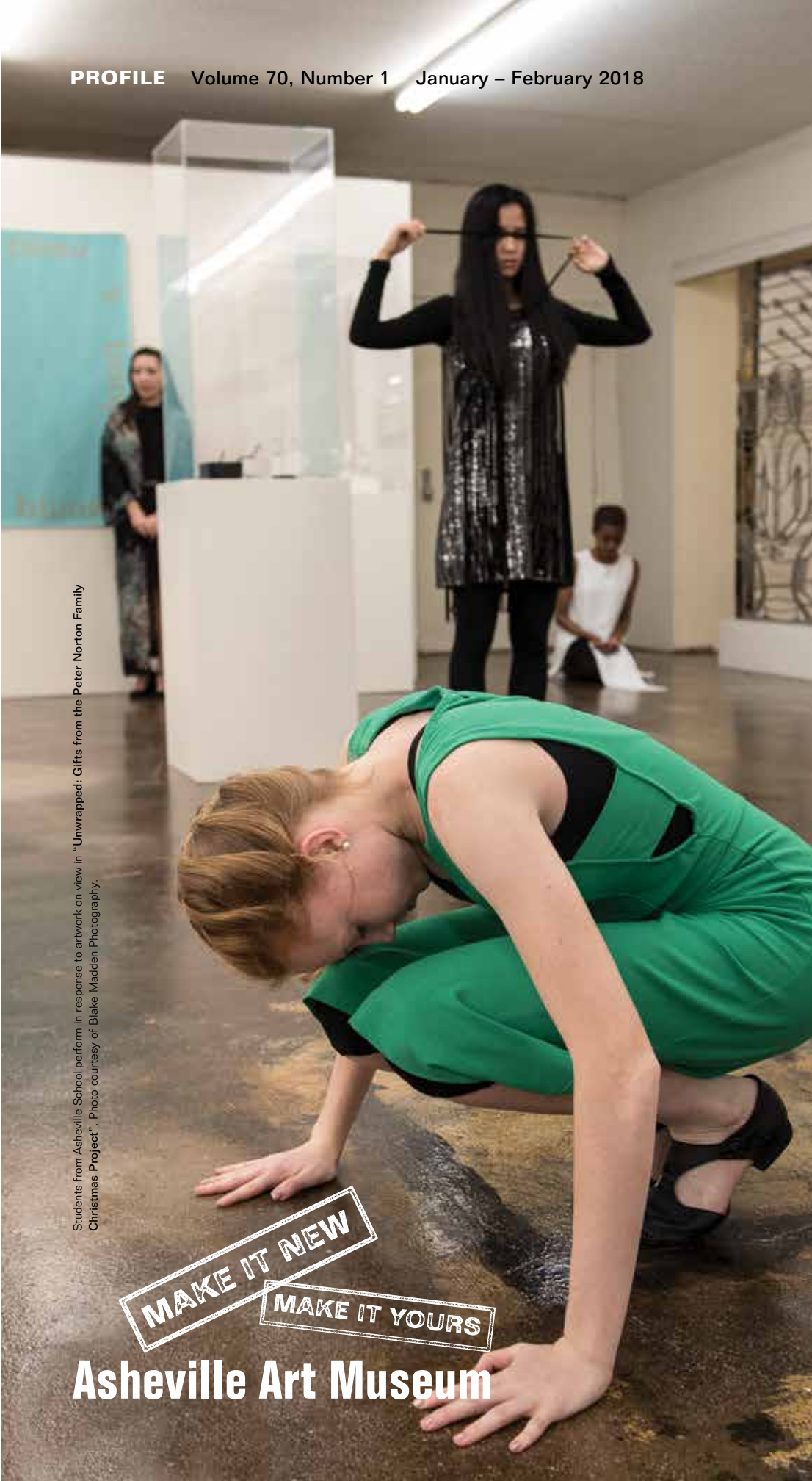
Students from Asheville School perform in response to artwork on view in “Unwrapped: Gifts from the Peter Norton Family Christmas Project”.

Saturday, JUNE 9 — Renaissance Asheville Hotel