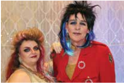
Our Annual Benefit Gala on June 9 was a huge success! For a list of all the generous supporters who helped make it happen, visit ashevilleart.org/supporters .

The Museum couldn’t do what it does without its generous supporters. For a list of the individuals, organizations and companies who recently supported the Museum through in-kind donations; gifts and grants; annual fund; and tributes, please visit www.ashevilleart.org/supporters .