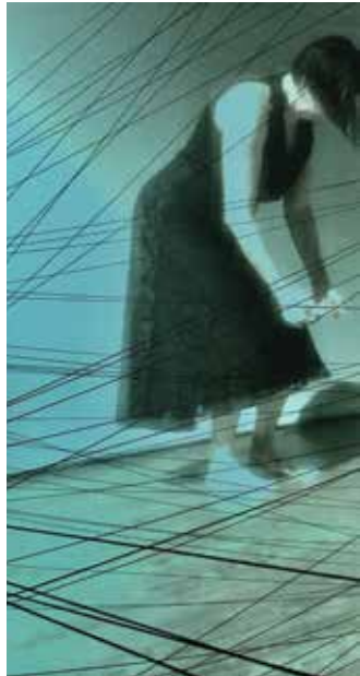
BELOW: Photo of Grains of Breath, Out of Sand .