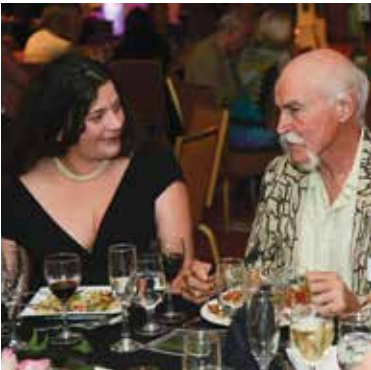
Guests mingle at the 2016 Gala.

We are busy planning for our annual benefit Gala, the Museum’s largest fundraising event of the year. Join us for a dazzling evening of fine food, drinks and art on Saturday, June 17 . Stay tuned for details!