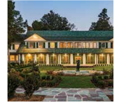
Join our Art Travelers on a trip to the Reynolda House Museum of American Art in Winston-Salem

APRIL 20 — Friday, 9:00 a.m. - 6:00 p.m. $115 Museum members, $125 non-members (includes transportation, tours, and lunch) Join us for a day trip to Winston-Salem, NC, to enjoy a day filled with American art, good food and great company! Discover the Reynolda House Museum of American Art's special exhibition Frederic Church: A Painter's Pilgrimage on an exclusive private tour with Ken Myers, Curator of American Art at the Detroit Institute of Arts. Space is limited; register by April 5.