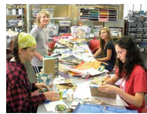
The Museum offers unique weekly Summer Art Camp sessions for K-12 students.

MARCH 15 + APRIL 19 — 10:30 a.m. Located at 260 Overlook Road, Asheville