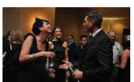
Guests mingle at the 2015 Gala