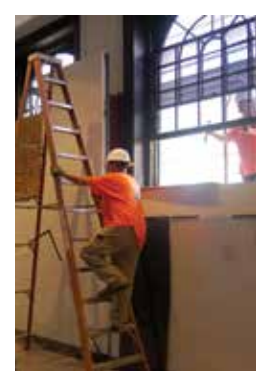
The windows in the Museum's North Wing (the Historic Pack Memorial Library) are being restored.

As historic preservation and renovation work continues on the Museum's North Wing this spring, we are excited to introduce you to the team leaders bringing the New Asheville Art Museum to our community.