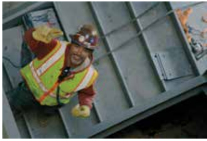
ABOVE AND BELOW