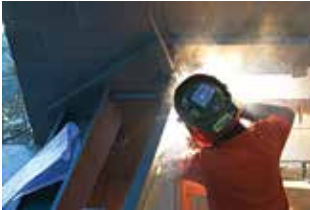
A construction team member helps us Make It New.