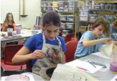
Summer campers get creative during our 2017 Summer Art Camp. Registration is open for 2018 sessions!

MAY 17 — 10:30 a.m. Located at 260 Overlook Road, Asheville