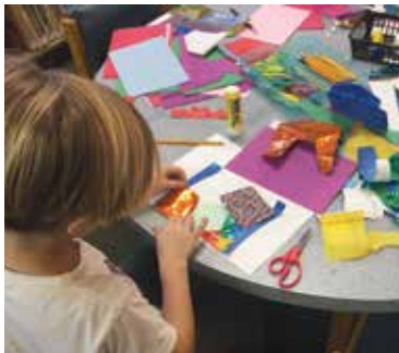
FROM TOP: Students spark their creativity during the Museum's After School Program at Isaac Dickson Elementary School.