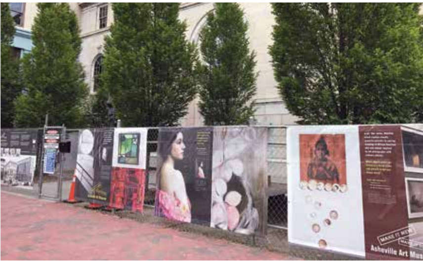
BELOW: Join us for Art Breaks at our construction fencing to learn more about our Collection and about the NEW Museum.