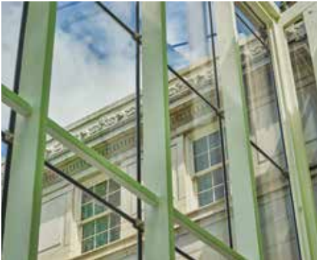
FROM LEFT: Participants of the Museum's pilot programming for Connections make art in the studio. The Museum's new building juxtaposes historic and modern architecture.