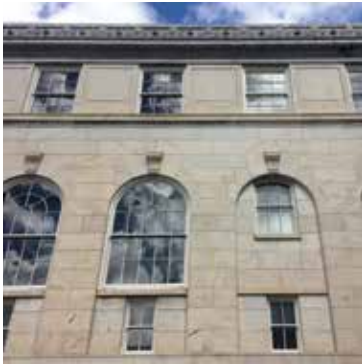
Work was completed on the Museum’s North Wing building in August, and the scaffolding came down.

It’s an exciting time for us, with important decisions being made as we prepare for major construction work. While the Museum will move out of our current facilities this fall to allow for construction and to keep our Permanent Collection safe and secure, we will continue an active schedule of programming off-site with community partners across WNC. In addition, the Museum is planning for a small Pop-Up Museum during construction to house the Museum Gift Shop, education programs for all ages, and a rotating intimate exhibition gallery. We are currently finalizing location details — stay tuned for announcements in the coming weeks!