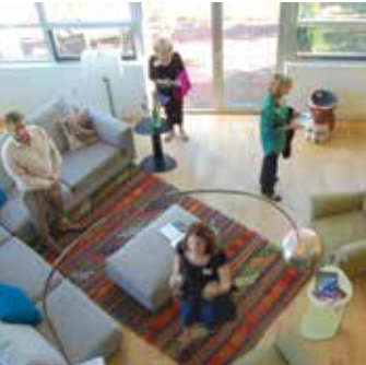
We are hosting our annual Urban Loft + Art Tour on October 12.

We invite you to privately tour Downtown Asheville’s most stunning art-filled lofts and impressive architecture during the Urban Loft + Art Tour 2017. We will also provide an update on the Museum’s construction project. Departing from the Museum On the Slope at 175 Biltmore Avenue, the former Foam & Fabric building, timed walking tours begin at 3:00 p.m. and continue every 15 minutes thereafter. Walking tours last approximately 90 minutes. At the conclusion of their tour, guests are invited to enjoy beverages and light hors d’oeuvres at an ongoing reception being held at the Slope from 5:30 – 9:00 p.m. (Please ask about our low-impact tour options to accommodate people with mobility concerns.) This year, we are also offering VIP Red Carpet options at 4:00 and 6:00 p.m. that include additional lofts, galleries + more (Museum members $70, non-members $75). Visit www.ashevilleart.org for more details.