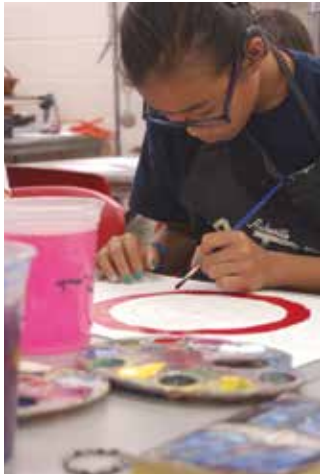
ABOVE: This fall, we have several “pop-up” programs for kids out in the community.

SEPTEMBER 21 + OCTOBER 19 — 10:30 a.m. Located at 260 Overlook Road, Asheville