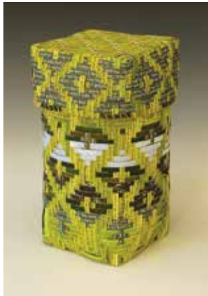
ABOVE: Shan Goshorn, Home Land , 2016, Arches watercolor paper splints printed with archival inks, acrylic paint, artificial sinew, 6 x 6 x 9.5 inches. 2016 Collectors’ Circle purchase with additional funds provided by 2016 Collectors’ Circle members Gail and Brian McCarthy.

We are spotlighting a few mediums from our Collection that have a special connection to our region: North Carolina Pottery ; North Carolina Glass ; and Cherokee Baskets . These installations are rotating every several weeks among SECU branches in South Asheville, near UNC Asheville and in Weaverville. Visit ashevilleart.org for the current location of each installation.