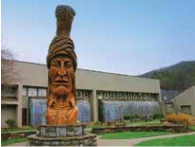
Art Travelers take a trip to Cherokee, NC in the fall.